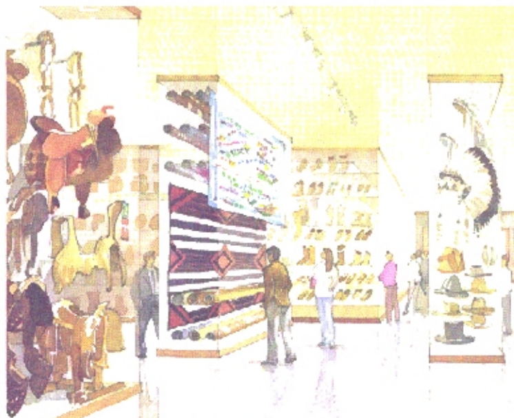
(Above) Open Collections

And for those who prefer to join us via the Web, an Autry Memory Bank server will allow visitors to upload finished works which will be judged and given annual awards by a vote of all Web visitors.