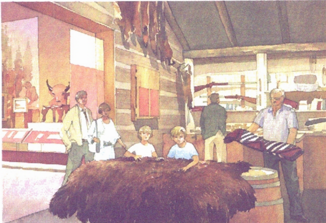
(Above) Immersion Environment: Gallery's version of Trading Post